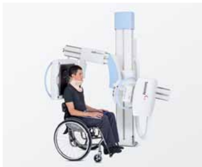
Ideal for patients with special needs.

Advanced engineering with electro-magnetic controls ensures safe and effortless manual system positioning. With the C-arm design, the X-ray tube is always centered to the detector, which makes patient positioning fast, precise and convenient. For orthopedic, pediatric and geriatric applications, the ddRElement ™ performs off-center imaging. The X-ray tube rotation enables off-detector imaging on portable detectors or cassette-based media for the patient that cannot be transferred to the imaging table.