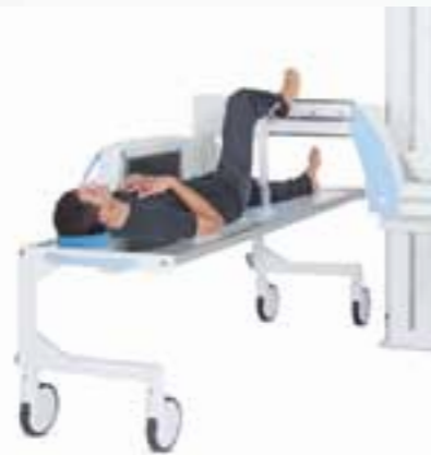
Ideal for special orthopedic examinations.