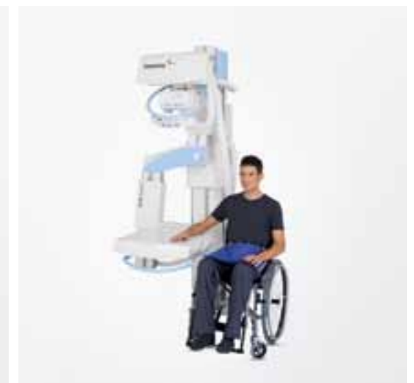
Off-center imaging with patient comfort in mind.