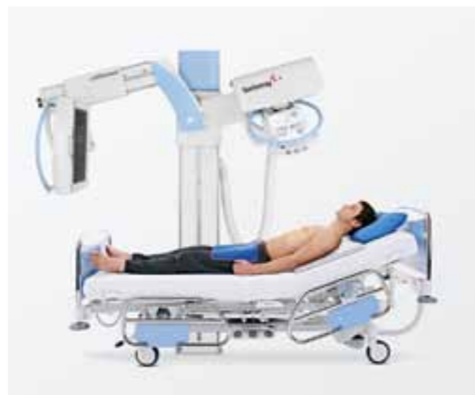
Off-detector imaging with portable detectors or cassette-based media.