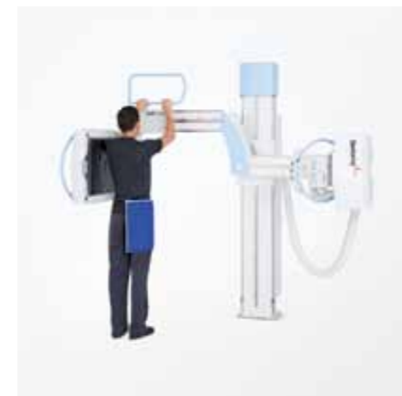
Chest imaging with up to 200cm SID (FDD).

The ddRElement™ caters to patients unable to position their extremities in the center of the detector with fast and convenient setup to perform off-center imaging.