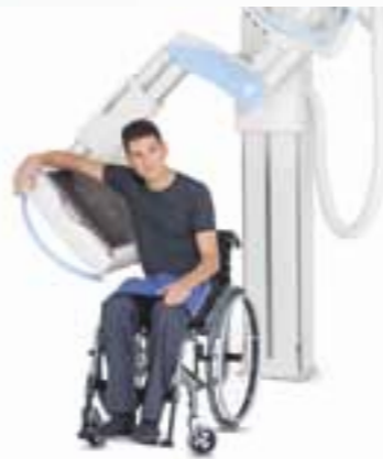
Fast, precise and convenient patient positioning.