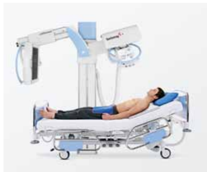
Off-detector imaging with portable detectors or cassette-based media.